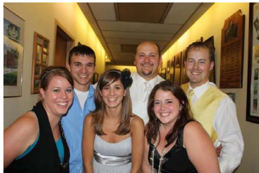
Past State Officers celebrate with the first wedding of their team